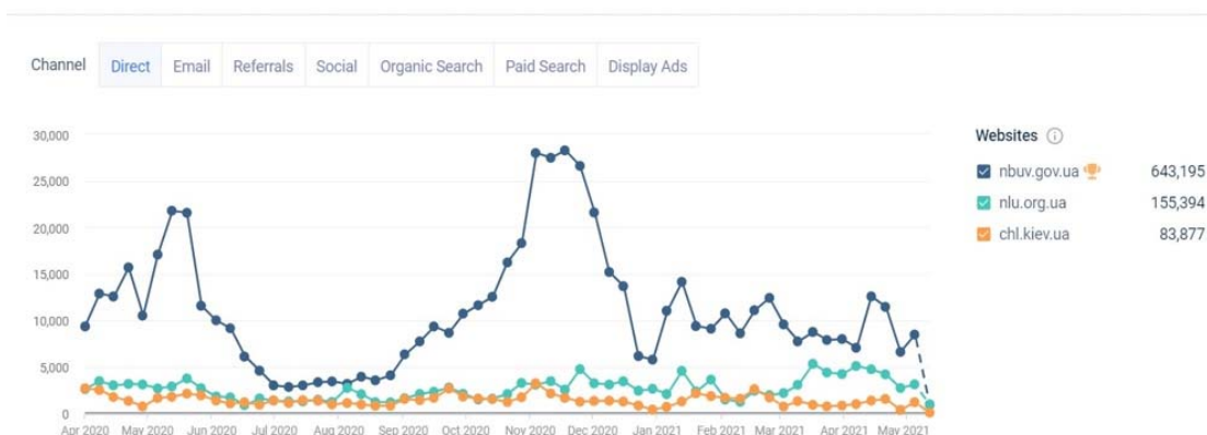
Fig. 3. Statistics of direct user requests to library websites (Vernadsky National Library of Ukraine, Yaroslav Mudryi National Library of Ukraine, National Library of Ukraine for Children)