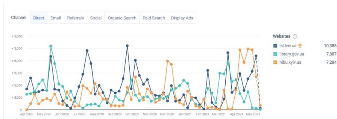
Fig. 4. Statistics of direct user requests to library websites (Lviv Vasyl Stefanyk National Scientific Library of Ukraine, National Scientific Medical Library of Ukraine National Historical Library of Ukraine)

Taking into account the above-mentioned, it is possible to state that the indicated factors make it impossible to create appropriate information and analytical structures at the proper quality level at national libraries. Wherein, there is a clear understanding among specialists of the fact that information and analytical structures could become an important form of library participation in solving the main problems of socio-economic reforming the country.